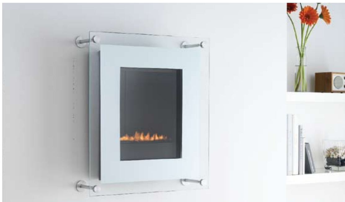
Elite™ CVF shown