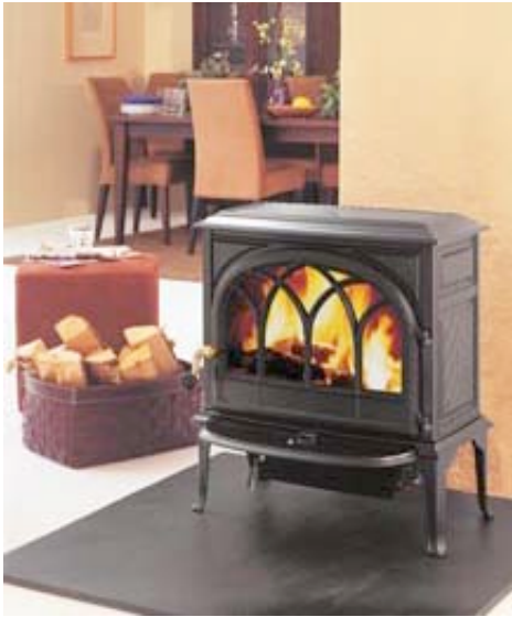
Jøtul F 400 Castine Blue-black Porcelain Enamel

Jøtul's medium-sized single door, non catalytic woodstove just got better, with enhanced fire viewing and air wash performance. Featuring meticulous craftsmanship and design, the Jøtul F 400 Castine will provide a warm, wonderful centerpiece for your hearth and home. Created by award winning designers, this stove has a unique nautical theme which highlights the tradition of seacoast living, a lifestyle shared by residents of Maine and Norway.